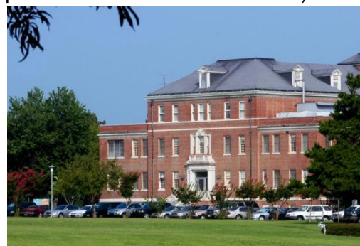
The SC MIRECC fellowship is located in building 58 at CAVHS.

Jeffrey Pyne, MD : Telemedicine; PTSD; psychophysiological assessment; virtual reality; substance use disorders; cost-effectiveness analyses; mental health-clergy collaboration