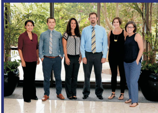
The Coaching into Care Team